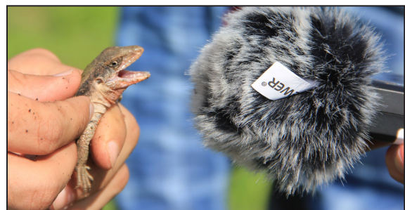
FIGURE 1. Procedure to stimulate the vocalizations of the captured Balsas Basin Whiptails ( Aspidoscelis c. costatus ) from Mexico in the field. The digital recorder was employed to record the vocalizations, which had a protective cover to filter out the wind. (Photographed by Oswaldo Hernández-Gallegos).

For the call characterization, we measured the fundamental and dominant frequencies, plus the number of harmonics, at the beginning of the vocalization. Then, by visual inspection (e.g., Eckenweber and Knörnschild